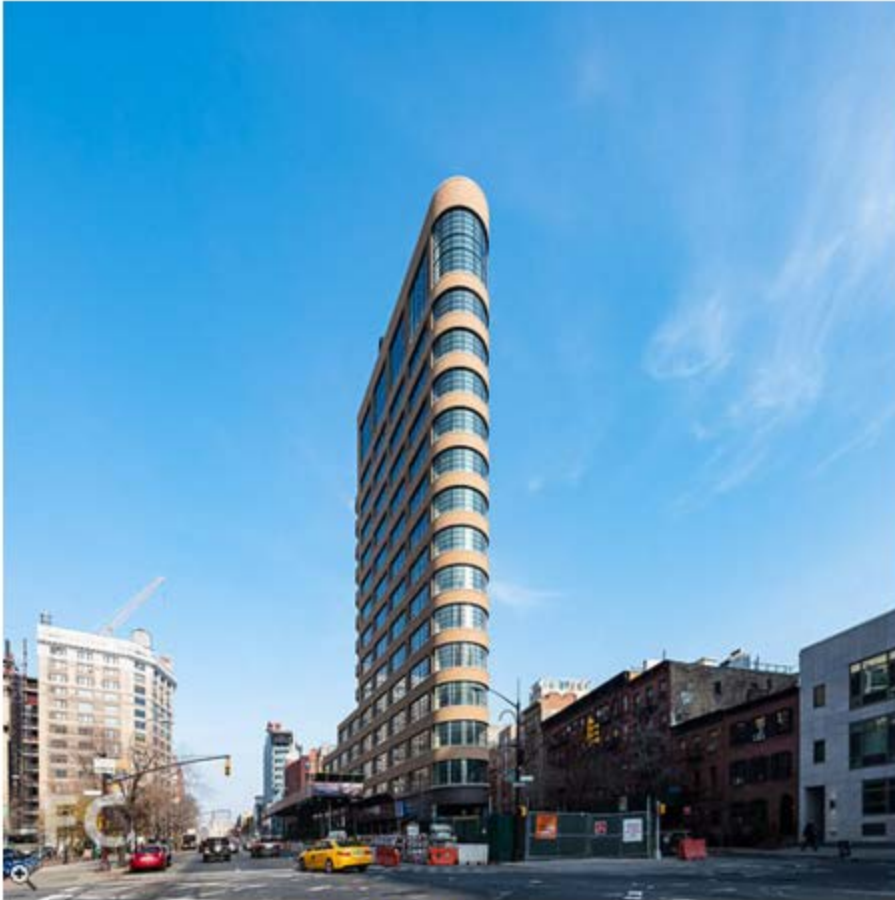
[10 Sullivan Street. ]